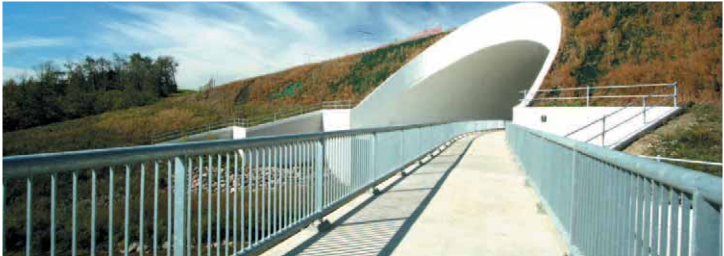
Whitemud Creek Arch Pedestrian Bridge design receives IStructE Award

Associated Engineering received the Institution of Structural Engineers (IStructE)'s prestigious Commendation Award for our design of the pedestrian bridge for the Whitemud Creek Arch on Edmonton's Anthony Henday Southwest Ring Road. The Whitemud Creek Arch Pedestrian Bridge was one of two Associated Engineering designs that IStructE shortlisted for awards; the Blackmud Creek Bridge was chosen as a finalist in the Transportation Structures category.