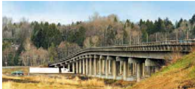
Colebrook Road overpass

The Colebrook Road Overpass in Surrey, BC provides a critical north-south link across the city. Part of the Greater Vancouver Transportation Authority (TransLink)'s Major Road Network (MRN), the structure was built in 1974 with a 50 year service life. However, in less than 30 years, the structure had begun to exhibit signs of accelerated concrete deterioration in the deck, deck joints, and concrete components below, resulting from elevated chloride ion (salt) concentrations. In addition to the need for rehabilitation, the bridge was identified as a priority for seismic assessment and retrofit. The City of Surrey retained Associated Engineering to complete a detailed bridge assessment and seismic analysis, develop a rehabilitation strategy, and design seismic upgrades.