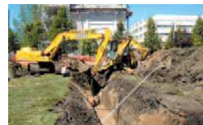
University of Regina Lab Building

pre-design, and detailed design, and has provided general engineering and resident inspection services during construction for several developers in Saskatchewan. There is currently a lot shortage in both Regina and Saskatoon with little or no inventory. In fact, most of the lots approved for development this year have already been sold. The City of Regina, currently sold out of industrial property, is planning to develop 35 acres this year and 65 acres in 2008.