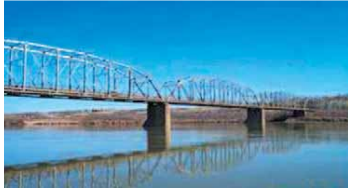
Structure on Saskatchewan Bridge Inventory

In the last issue of AE Today, we reported that the Saskatchewan Association of Rural Municipalities in conjunction with Saskatchewan Highways and Transportation (SHT) had retained Associated Engineering to complete a bridge and culvert strategic asset management study on their behalf. The Saskatchewan Association of Rural Municipalities owns and maintains 3900 bridges and culverts located throughout Saskatchewan.