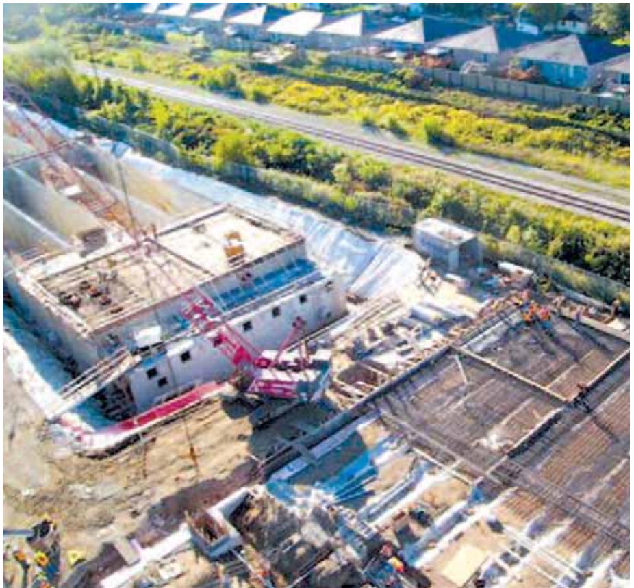
View of Belle River Water Treatment Plant from tower cam

"Every project has its unique challenges," says Ed. "My philosophy is 'On time and on budget, while fully meeting the client's expectations.' Sounds simple, but it is not always easy to do. Water and wastewater treatment facilities are always multi-disciplinary undertakings and getting everyone to understand their scope and deliverables are key tasks for the project manager."