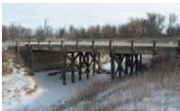
Structure on Saskatchewan Bridge Inventory

Due to inconsistencies between documented and actual bridge conditions, the major recommendation from the study was to conduct a full network inspection. The inspection would identify any unsafe structures and recommend repairs or replacement to mitigate the potential for liability due to a structure failure. A full inspection would