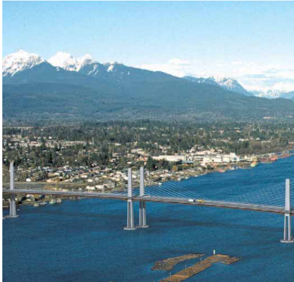
Artist's rendering of Golden Ears Bridge

Infrastructure Journal in the UK has selected the Golden Ears Bridge project in BC as the recipient of the "Global Deal of the Year". This is the highest award given annually by Infrastructure Journal and considers projects in all sectors around the world.