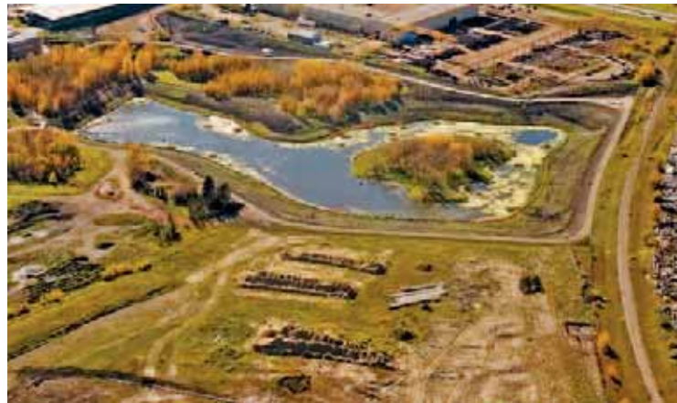
Aerial view of Mill Creek Roper Pond

During major storms, the City of Edmonton's Argyll Tunnel, a major stormwater sewer that discharges to the North Saskatchewan River, can become overloaded and cause flooding in the Mill Creek drainage basin. The City sought a sustainable stormwater management solution to address potential flooding, and retained Associated Engineering to develop the design, oversee construction, and provide overall project management.