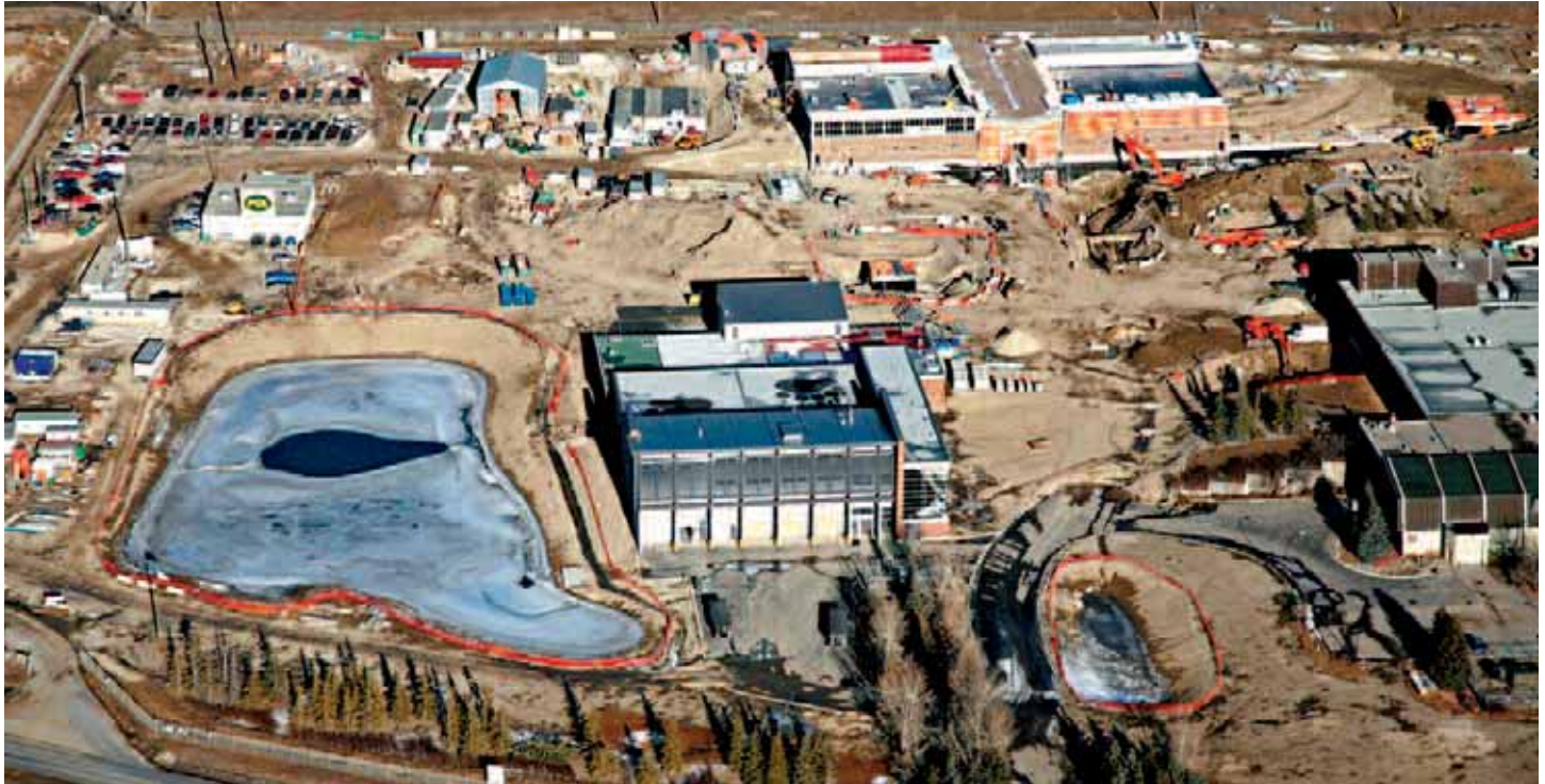
Aerial view of the Bears paw Water Treatment Plant upgrade showing new Residuals Treatment Facility (building next to overflow lagoon) and the new Pretreatment Facility under construction (at back).

In anticipation of the new Alberta Environment Standards for potable water treatment systems, the City of Calgary embarked on comprehensive upgrade studies and piloting at its two water treatment plants in early 2000. As a result of these studies, a number of process upgrades were identified. Due to the size of the water treatment upgrade program, the City decided to adopt a partnership approach with PCL Construction Management Inc. as the Construction Manager and Associated Engineering as the Prime Consultant. Our involvement includes studies, predesign, detailed design, and construction management of upgrades to the Glenmore and Bears paw Water Treatment Plants.